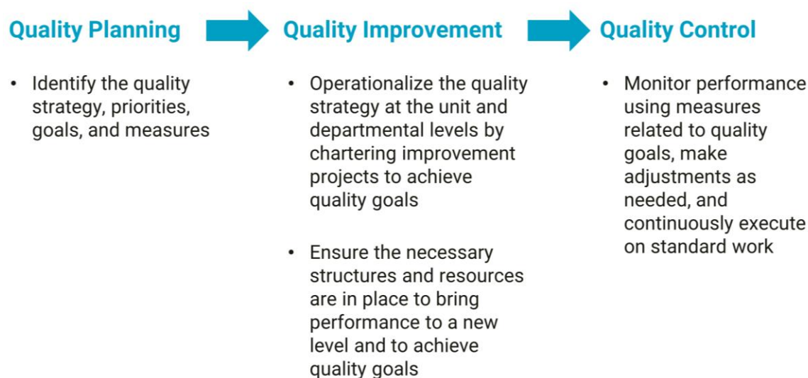
Figure 8. Relationship Between Quality Planning, Quality Improvement, and Quality Control

The specific structure of the quality improvement system in each organization may differ, but successful QI systems share similar elements as described below.